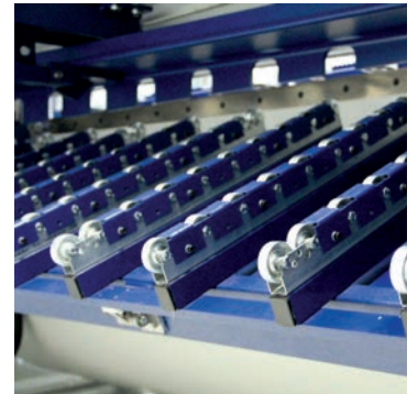
Sheet support, pneumatically controlled

The design of the extreme rigid machine body of the new PowerShear Professional is based on decades of experience in industrial cutting. It was engineered with state of the art tools, using the finite elements method and computer simulations.