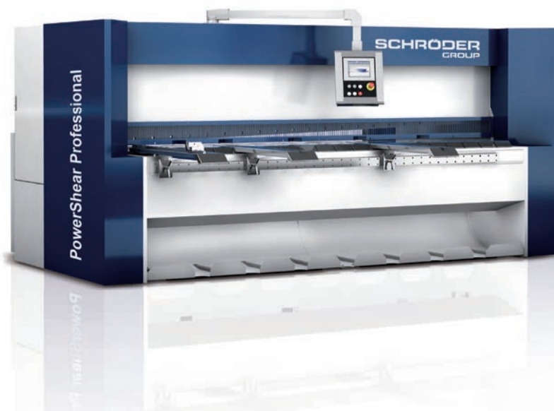
The PowerShear Professional with energy-efficient drive ensures precise, burr-free and torsion-free cuttings.. The picture above shows the machine with the optional Professional-Package.

The hydraulic shear PowerShear is the industrial solution in order to cut loads of big sheets at high speed. The robust and yet precise machine is ideal for continuous operation in workshops, mid-sized companies and the industry.