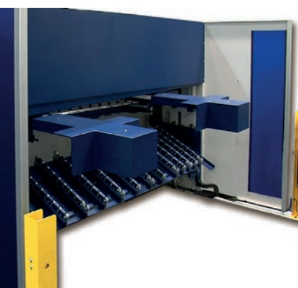
Rear view: Motorized back gauge and shear support as well as rear light barrier.