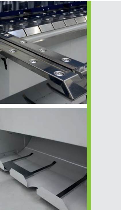
Sheet shute to the front